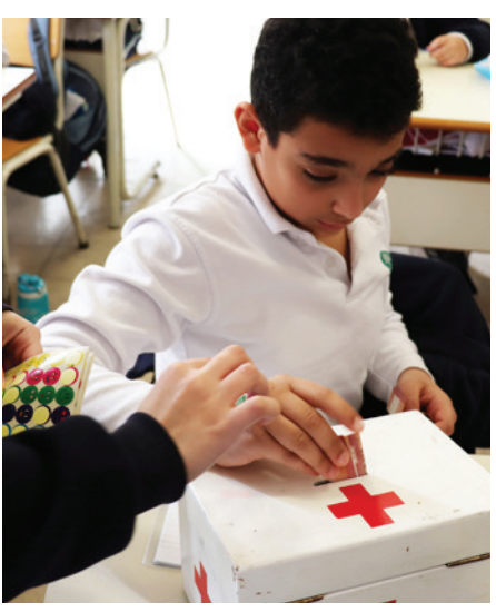
Grade 1-3 Career Day

Grade 1-3 students had the opportunity to participate in Career Day, an event where they passed by stations that represented different professions so they could decide what they want to be in the future.