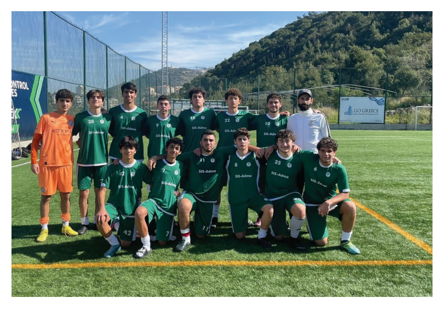
U14 Boys Football: 1st place Varsity Girls Basketball: 1st place