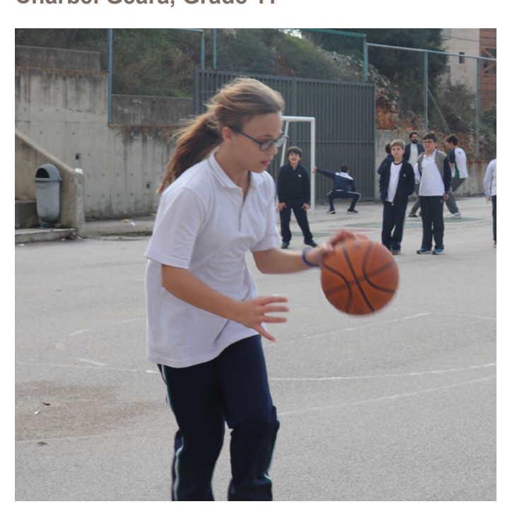
"The basketball tournament was a lot of fun and we ended up beating the team we first lost to in the finals!"