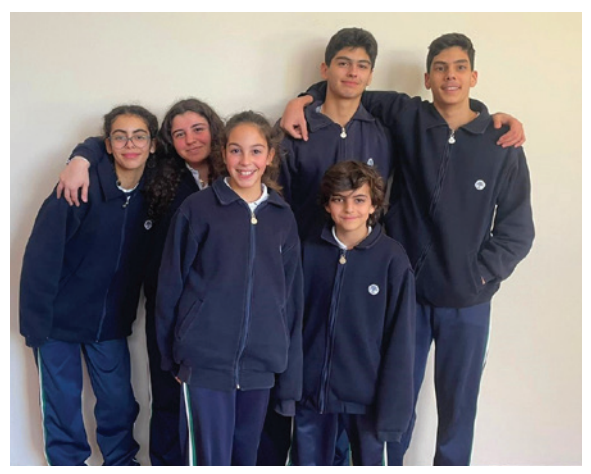
The qualifications are as follows: U14 Boys Soccer: 1st place

Varsity Girls Basketball: 1st place Swimming Team: 1st place