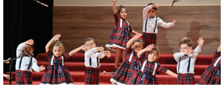
Grade 1 & 2