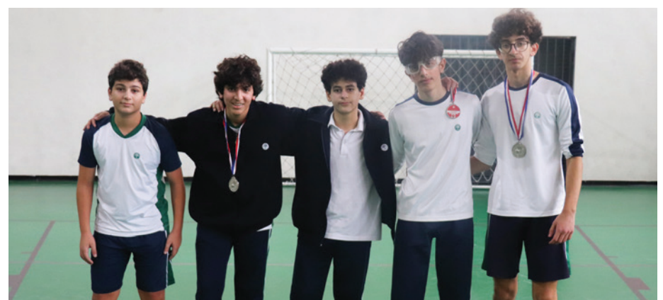
"The tournament was nice and competitive - it was easy to win."