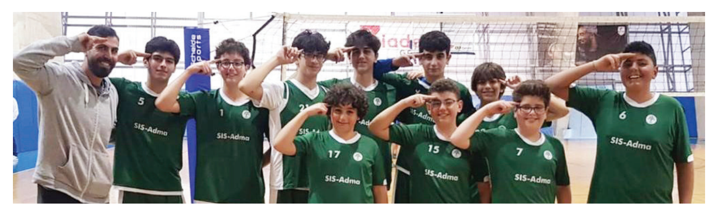
Girls Volleyball: 2<sup>nd</sup> place Boys Volleyball: 2<sup>nd</sup> place