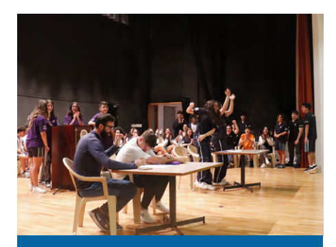
Throughout the competition, both teams were tied for a very long period of time, however the last question determined the students as the winners.