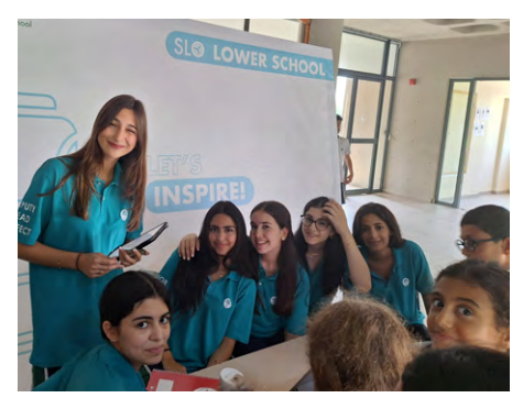
Hunt for Knowledge

"The SLO Academic Department's event was a very fun trivia experience. I appreciate all the effort that the department put into organizing this event. I would love to participate in another similar event with my friends."