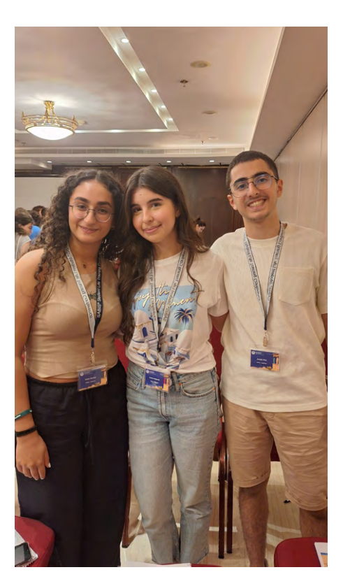
"Participating in the SLTC has been an incredibly enriching and eye-opening experience. The dynamic discussions and collaborative environment encouraged me to think critically and develop my ideas more confidently. Being part of this conference also enhanced my communication and leadership skills. I met so many different students from all around the world, with whom I had the opportunity to form lifelong friendships and connections. The opportunity to present my perspectives and receive feedback has been extremely beneficial in shaping my academic and future career aspirations. The memories I made are unforgettable and I am profoundly grateful for this amazing experience and highly recommend it to any student eager to make a meaningful impact and expand their horizons."