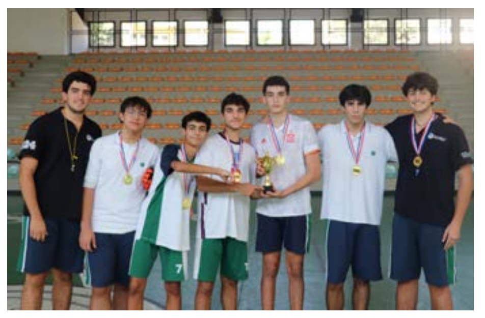
"Participating in the school's Euro Cup, and winning the player of the tournament trophy felt wonderful. It was a step that helped boost my confidence and increase my leadership skills."