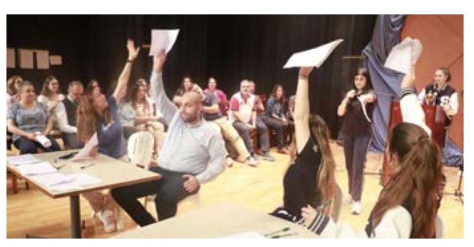
"The Students vs Teachers Trivia was a very amusing experience. The feeling of adrenaline rushing through our veins to get the answers right and beat our teachers was thrilling! Cheering on our fellow students and watching our score increase gradually only led to more feelings of excitement. It was a fun game that I would definitely participate in again. The best part was of course when the students took the trophy home!"