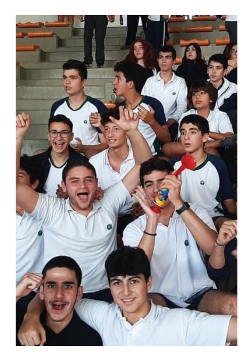
Senior Jacket Ceremony